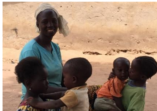
The external evaluators assessed the project's impact on the market for Aflasafe-treated maize and on smallholder farmers.

Before the project, lack of awareness about the adverse health effects of aflatoxins and Aflasafe as a solution meant there was a "missing market" for Aflasafe-treated maize (AT maize). Aflasafe costs also meant that Aflasafe would be economically viable for smallholder farmers only if there were a price premium on AT maize or if high enough yields were realized to offset its cost. Premium markets for AT maize such as export markets, supermarkets and the poultry feed market exist, but smallholder farmers and value chain actors had limited access to these markets because of high information costs and difficulties meeting the volume, service, and other quality requirements of these buyers.